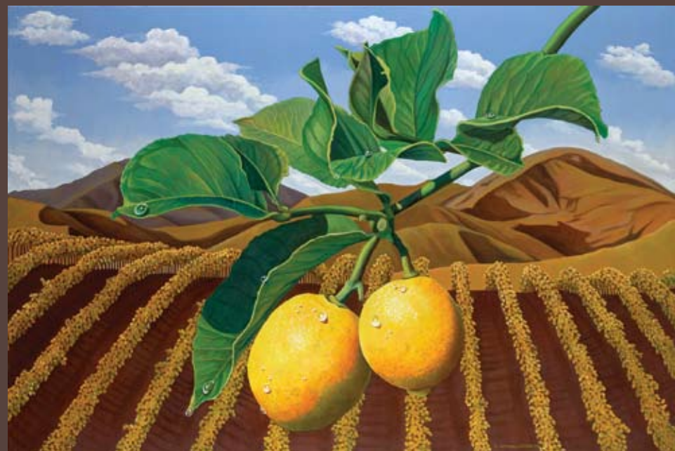
Approaching Autumn | Oil on canvas